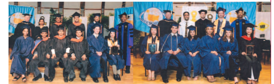
Fall 2004 graduates.